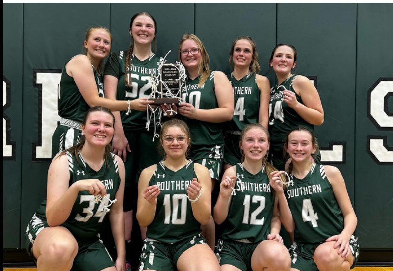
JV Girls Win County Title